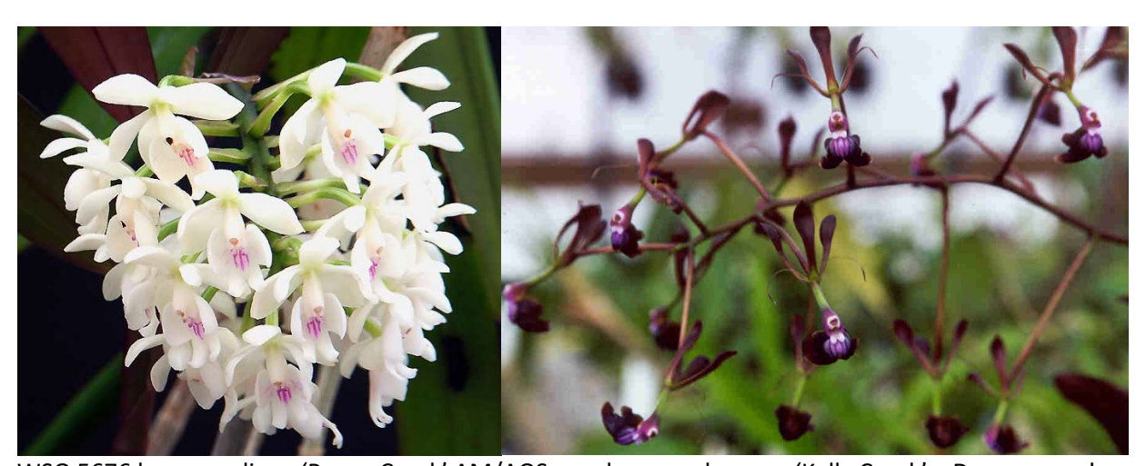
WSO 5676 hugo-medinae 'Penns Creek' AM/AOS x melanoporphyreum 'Kelly Creek' – Dream cross! Looking for compact plants with nice heads of purple flowers. Reddish foliage. A moderate light Epi. Easy to grow and bloom. 2.5" pots Seedlings $25; 3.5" pots Seedlings $30