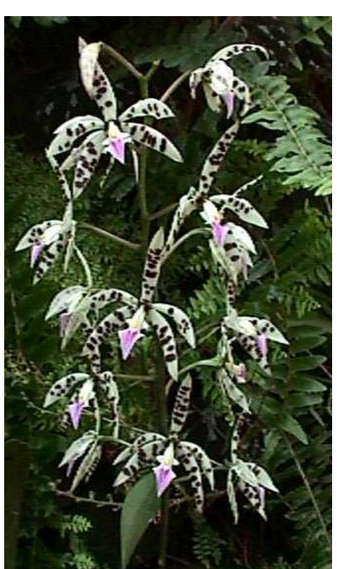
prismatocarpon – (Panama) Beautiful. 3.5-4.5"