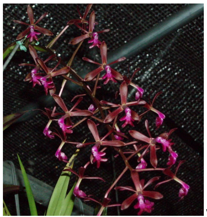
WSO 4768 Penns Creek

(cnemidophorum x melanoporphyreum – Yes, it is as good as it looks. The first to bloom of the Woodstream original hybrid received an AM/AOS. Reddish foliage. Don't miss this remake!! 2.5" pots Seedlings $25; 3.5" pots NBS Seedlings $35