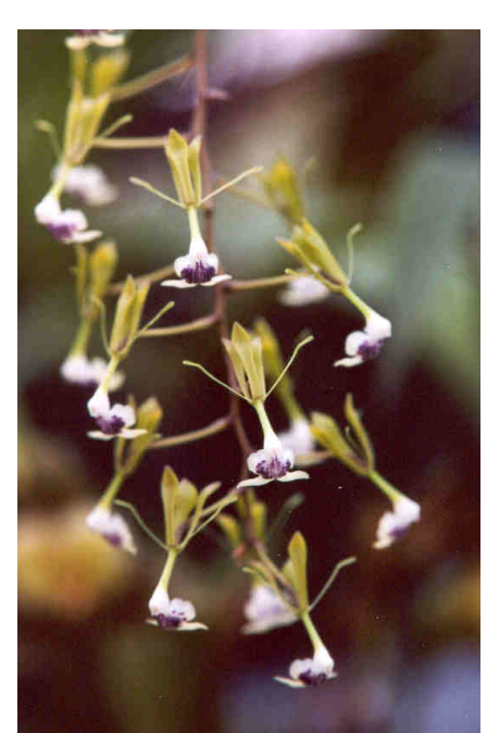
(Panama) Seedlings of this rare and unusual species. 2.5" pots Seedlings $15; 3.5-4.5" pots BS Seedlings $25

atrosciptum – (Mexico) One of a related group of