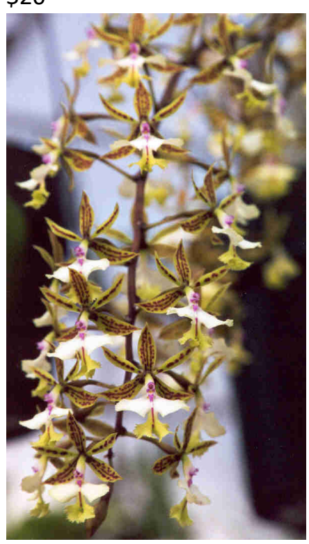
CHM/AOS – (Mexico) Another of the "scriptum" species. Lovely. 2.5" pots Keikis $20

stamfordianum 'Princeton' – (Mexico) 6" pots BS