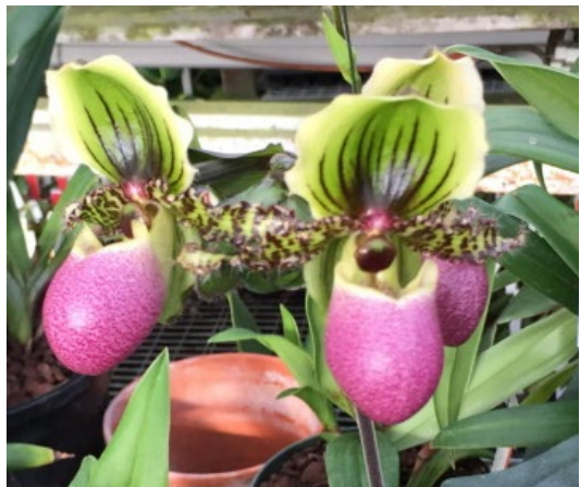
WSO 4749 victoria-reginae ('Savage River' AM/AOS x 'Benner Springs') – (Indonesia) Everyone should have this species in their collection. Large colorful sequential bloomer that can be in bloom literally for years! 2.5" pot 3-4" Is Seedlings $25; 3.5" pot 5-7" Is Seedlings $35