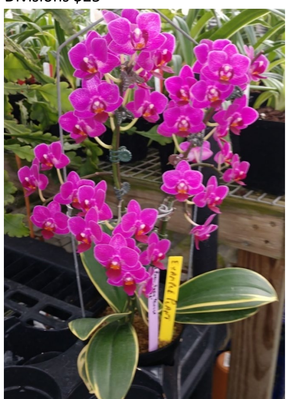
Sogo Yenlin 'Coffee' (Variegated) – A great

leudemanniana – (Philippines) Wonderful easy fragrant species. 4.5" pots BS Divisions $25