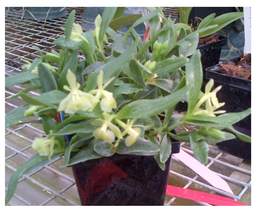
gregorii 'Penns Creek' -