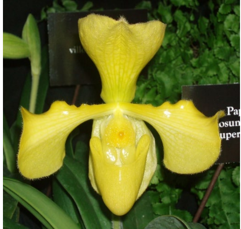
villosum forma aureum ('Yellow Holiday' x self) – ( India)