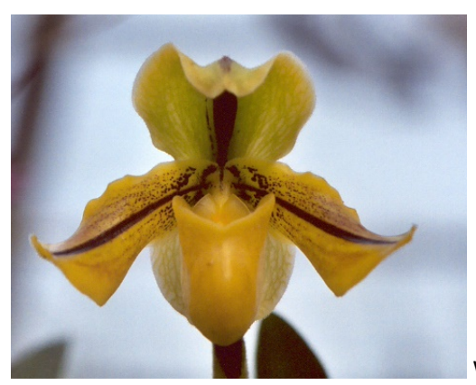
cultivation beautiful graceful flowers. 1 available 3-4" LS Seedlings $25; 1 available, NBS Seedling 3.5" pots $40

WSO 5325 druryi ('Floradise' HCC/AOS x 'The King' AM/AOS)