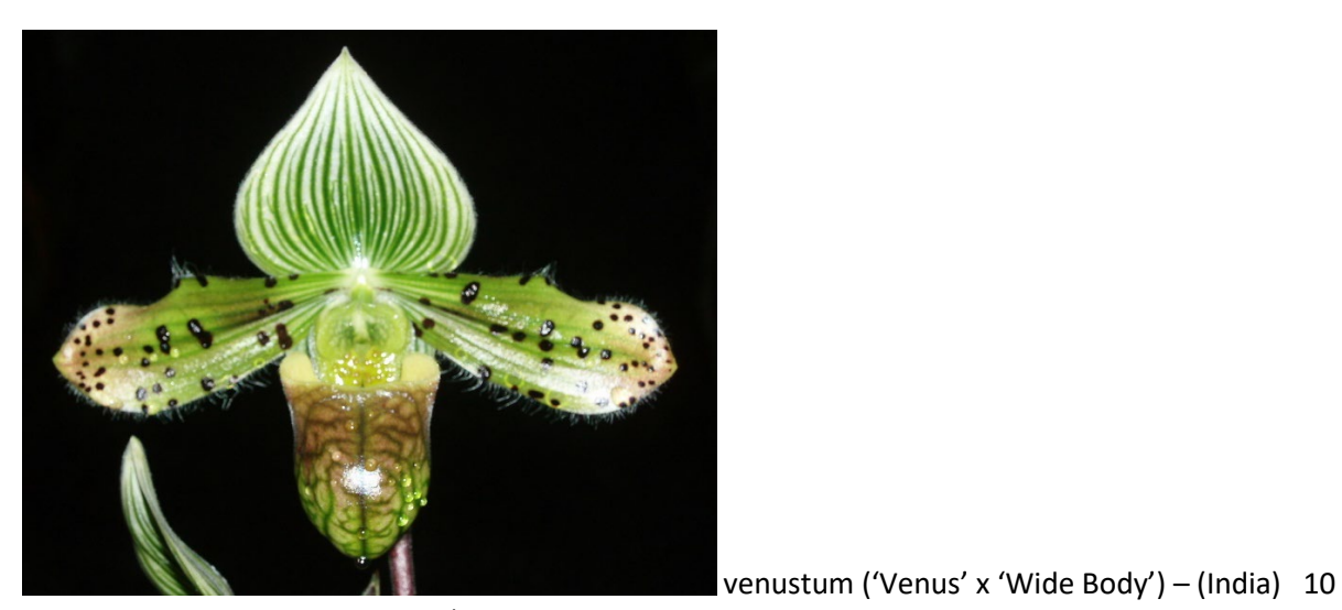
available. 3.5" pot BS Seedlings $35