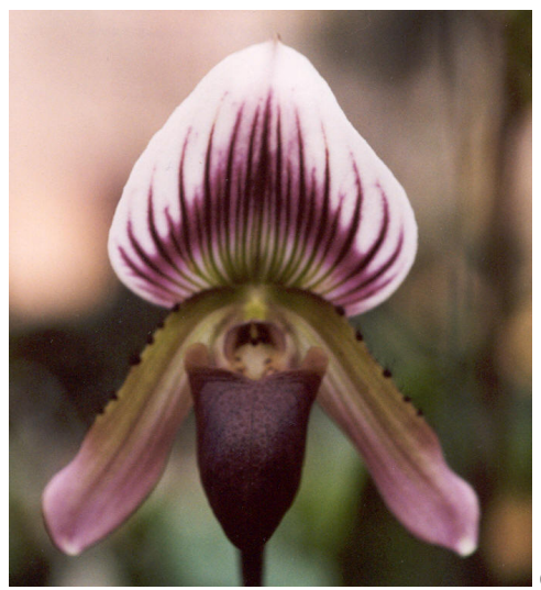
cultivation. 2.5" pot $25

callosum ('Select x sib) – (Thailand, Malaysia) Getting rare in