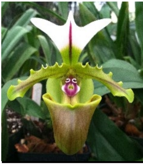
Milais' FCC/AOS,RHS) - (Borneo) King of Paph species. A great cross from Taiwan. 3.5-4.5" pots 12" ls Seedlings $50

WSO 2958 spicerianum ('Lick Run' x 'Penns Creek') - (India)