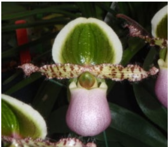
WSO 4751 liemianum ('Kelly Creek' AM/AOS x 'Penns