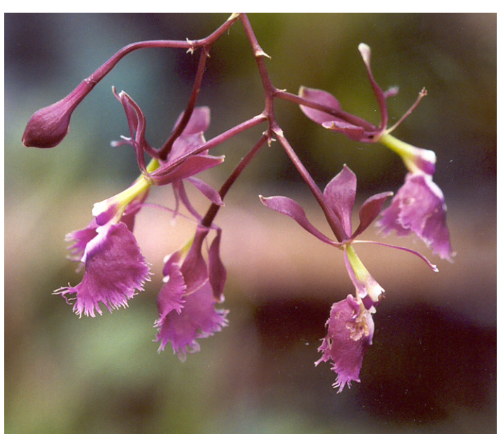
from the US Botanical Gardens collection. 3.5-4.5" pots BS Divisions $40