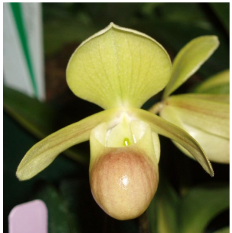
helenae 'Rullands Coulee Creek' - (China) Divisions of our best

helenae. A beautiful miniature species. 3.5" pots 1 available. BS Divisions $45