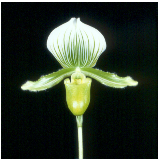
lawrenceanum var. hyeanum ('Sparkling' x self) – (Borneo)