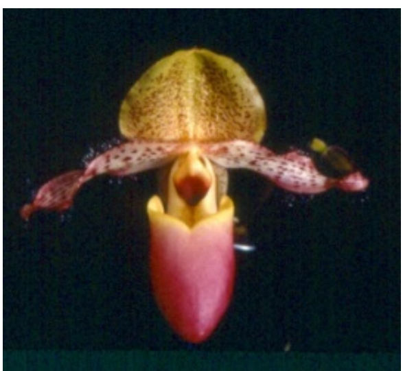
moquettianum ('Yang-Yi AM/AOS x sib) – (Sumatra)

Another beautiful sequential bloomer that is getting rare in cultivation. First to bloom of this cross received an AM/AS. Very limited. 3.5" pot NBS Seedlings $35; 4.5" pots BS Seedlings $45