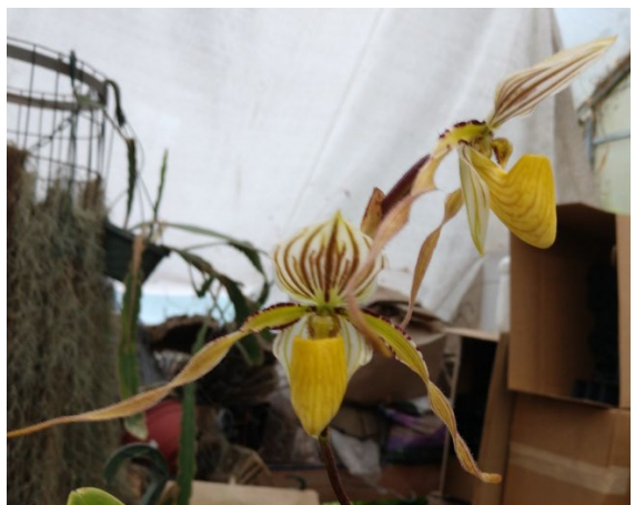
philippinense 'Mohawk' – (Philippines) A really nice

white Brachypetalum species that is easy to grow and bloom. Slightly fragrant. 10 available. 3.5" pot BS Seedlings $35