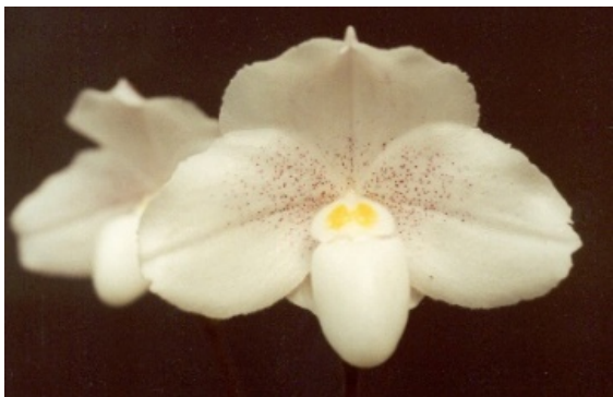
niveum ('Pinot Blanc' x 'Champagne') – (Thailand) Lovely

Another beautiful sequential bloomer that is getting rare in cultivation. First to bloom of this cross received an AM/AS. Very limited. 3.5" pot NBS Seedlings $35; 4.5" pots BS Seedlings $45