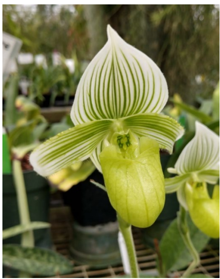
mennisianum album – (Philippines) Rare albino form of this

helenae. A beautiful miniature species. 3.5" pots 1 available. BS Divisions $45