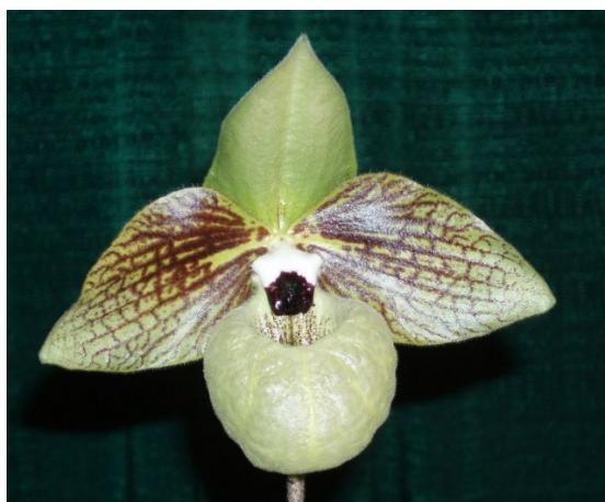
malipoense – (China)) Lovely flowers on tall stems. One of