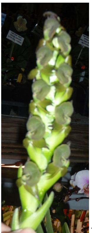
species. 3.5-4.5" pots BS Seedlings $25