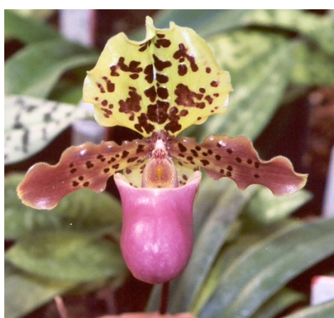
henryanum – (China) terrific compact-growing sib cross of this

charming and worthwhile species. Easy to grow. Very limited. 3.5" pots BS Divisions $45