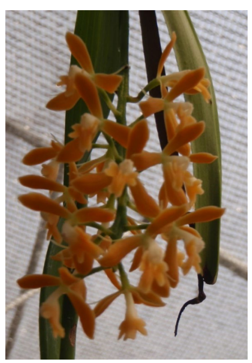
polyanthum – (Mexico) Easy to grow. Rare in

(cnemidophorum x melanoporphyreum – Yes, it is as good as it looks. The first to bloom of the Woodstream original hybrid received an AM/AOS. Reddish foliage. Don't miss this remake!! 2.5" pots Seedlings $25; 3.5" pots NBS Seedlings $35