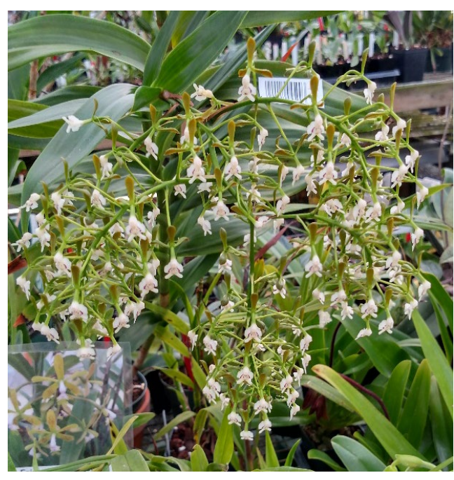
veroscriptum – (Mexico) 3.5 pot" $20