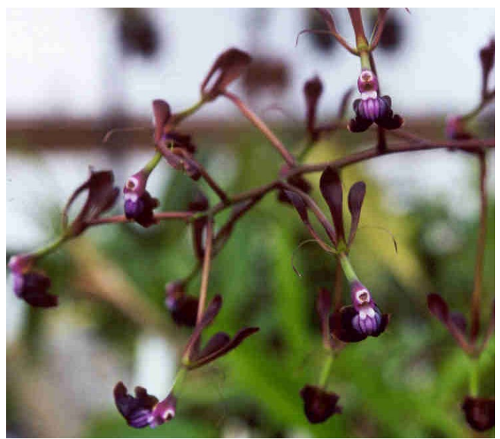
WSO 5561 melanoporphyreaum -