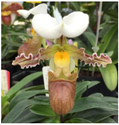
tranlienianum – Unusual miniature Chinese species looks like nothing

WSO 5386 tranlienianum ('Weitas Creek' HCC/AOS x 'Minion 12301' AM/AOS) – Unusual miniature Chinese species looks like nothing else. 3-4" Is Seedlings $25