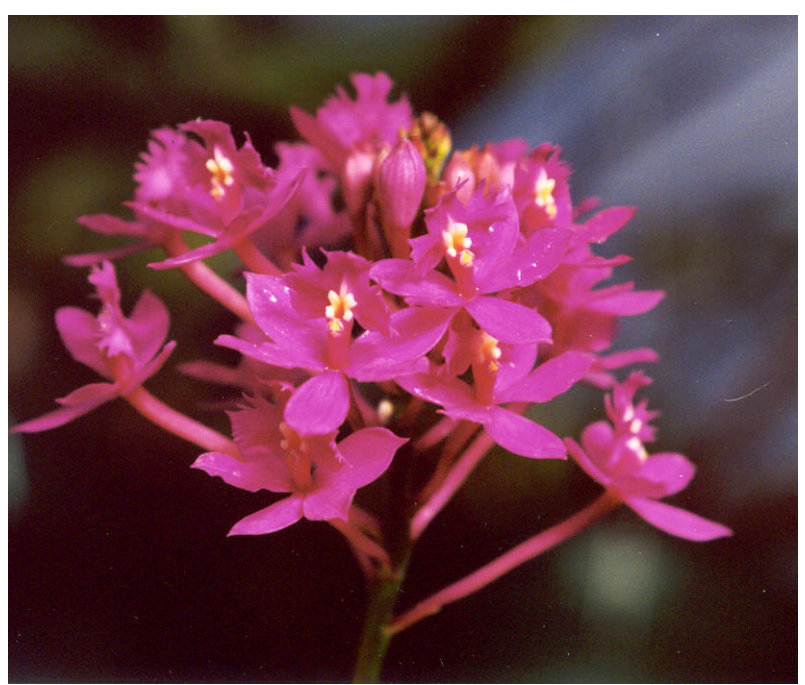
Miracle Valley 'Nodesh Ka' –