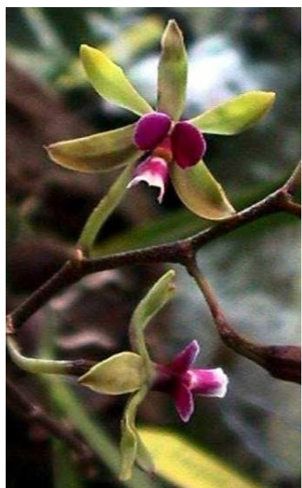
mooreana 'Penns Creek' — (Panama) tall branching spikes of beautiful 1 inch green flowers with magenta lips. Easy. 3.5-4.45" pot BS Divisions $35