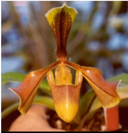
villosum ('Gigantea' x 'Expansion') – ( India) Vigorous blooming size multi-growth seedlings of this colorful long-lasting Himalayan species. One received an AM/AOS. 4.5" pot BS Divisions $35