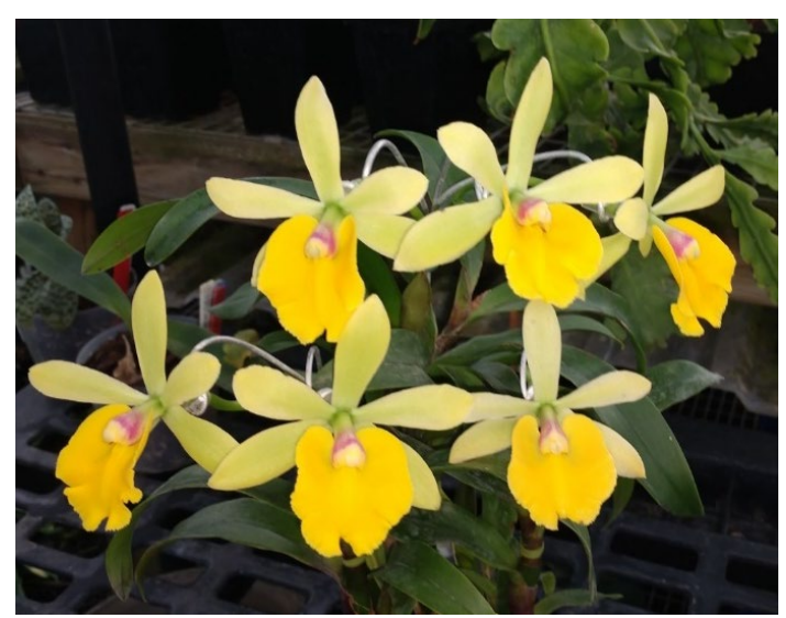
Eplc. Yokosuka Story 'Wilson' – A

great mericlone we picked up at a show. Beginning to spike. 3.5" pots BS mericlones $35